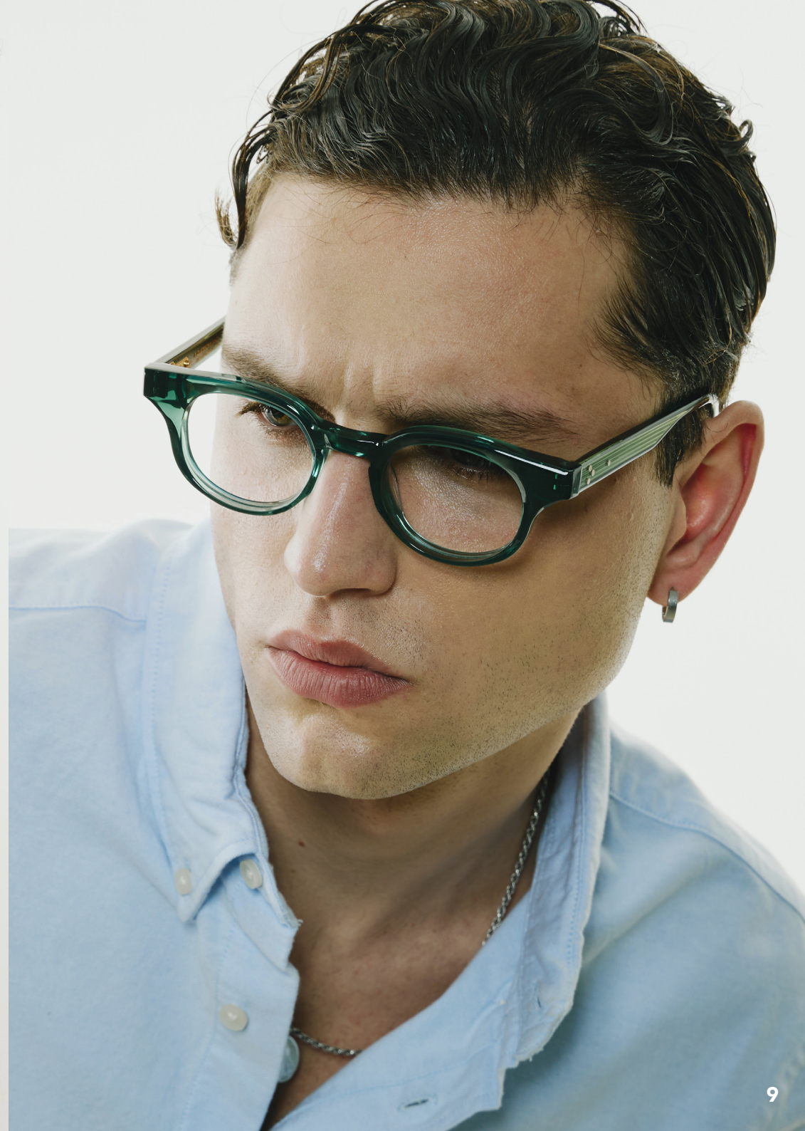
right Frame 35 C29