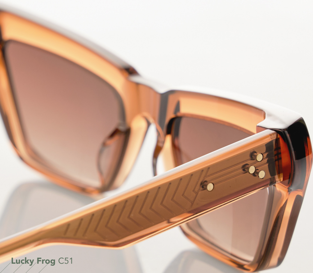
Lucky Frog C51

Between clean silhouettes and chunky frames, plays of color and crystal finishes, without ever overshadowing functional lightness .